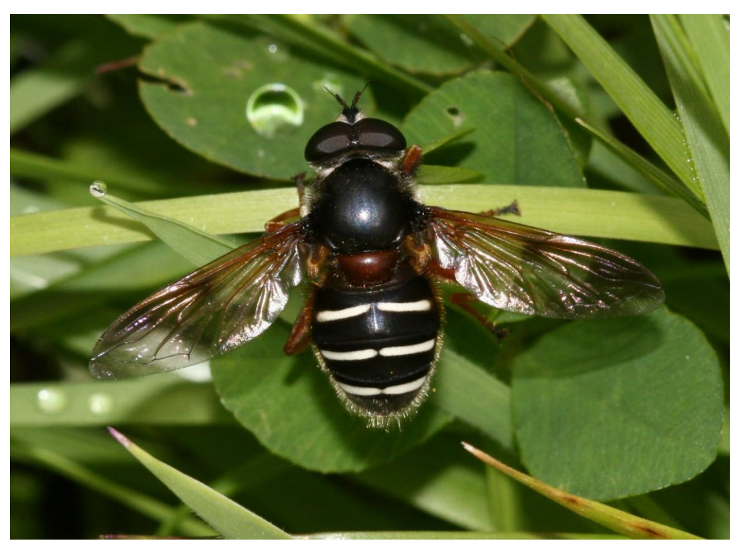
Male Hoverfly: Sericomyia lappona

ARCTOPHILA SUPERBIENS: Present at both lochs and breeds.