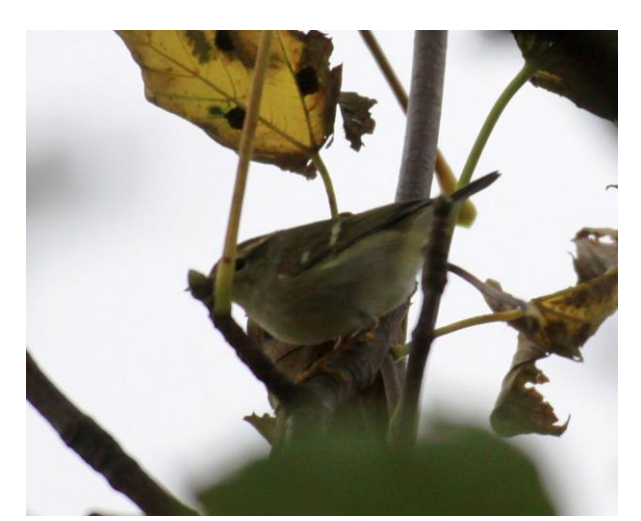
Yellow-browed Warbler, Castle Loch