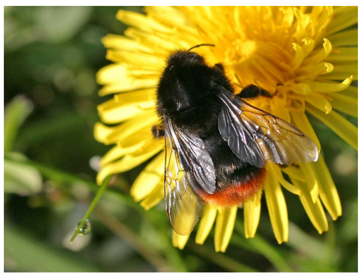
Queen Bombus lapidarius

BOMBUS PASCUORUM: Maximum number: 10 at Castle Loch (AR).